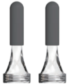
Sponge Ear Spoon x 2 Removing of earwax and grease in ears