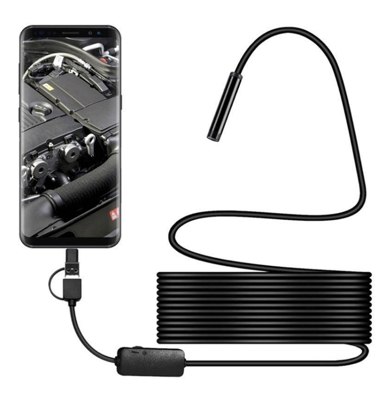
3-in-1 HD Endoscope - User Manual

This Endoscope camera is made of premium materials and is compatible with Android smartphones/PC computers/MacBook computers. It has a small camera head, adjustable LED lights, and an HD camera, and can display videos in real-time, record videos, and take photos. This endoscope camera is a handy tool for tight places or places that are hard to reach e.g. for car repairs, or the inspection of sewers or ventilation systems.